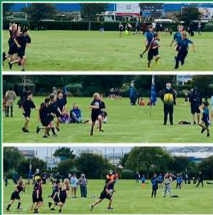
Our undefeated Y5/6 Touch Team GB Kahurangi in action at Kensington Oval last week against Balaclava.