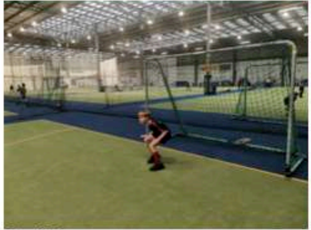
GB Sparks Futsal Team