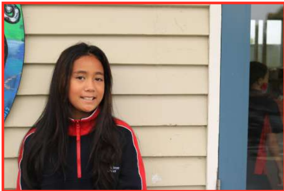
Charley in Room Piwakawaka