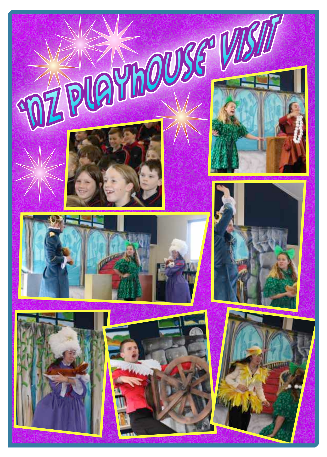
The NZ Playhouse's performance of 'Rumpelstiltskin' last Friday was thoroughly enjoyed by the children. This company tours the South Island every year, and they always put on a great show aimed at primary school age children.