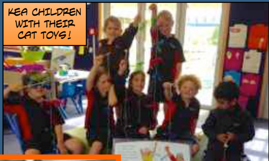
KEA CHILDREN WITH THEIR CAT TOYS!