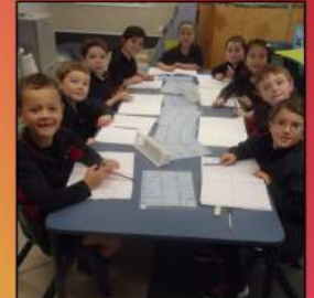
KIWI CHILDREN HARD AT WORK