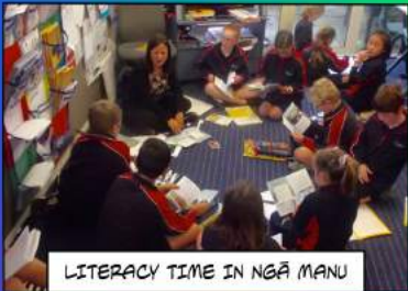
LITERACY TIME IN NGĀ MANU