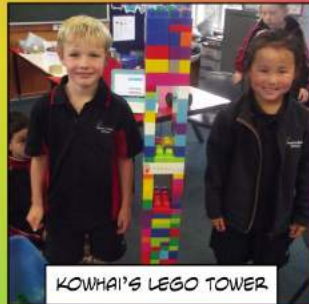
KOWHAI'S LEGO TOWER