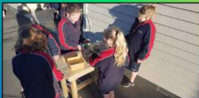
NEW WOODWORK TABLE A HIT WITH RATA AND KOWHAI CHILDREN