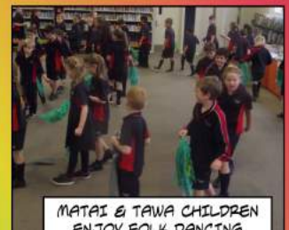
MATAI & TAWA CHILDREN ENJOY FOLK DANCING