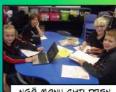
NGĀ MANU CHILDREN WORKING HARD IN BREAKOUT SPACE