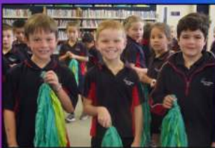
THESE BOYS ARE ENJOYING THEIR FOLK DANCING