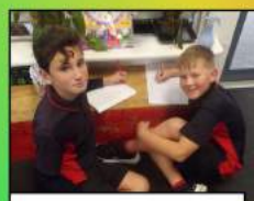
'POETRY SLAM' TIME IN TOROA