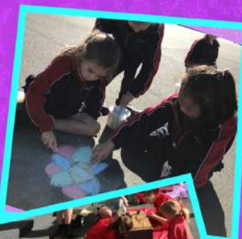
WĀ TUHURA TIME CONTINUES IN NGĀ MANU