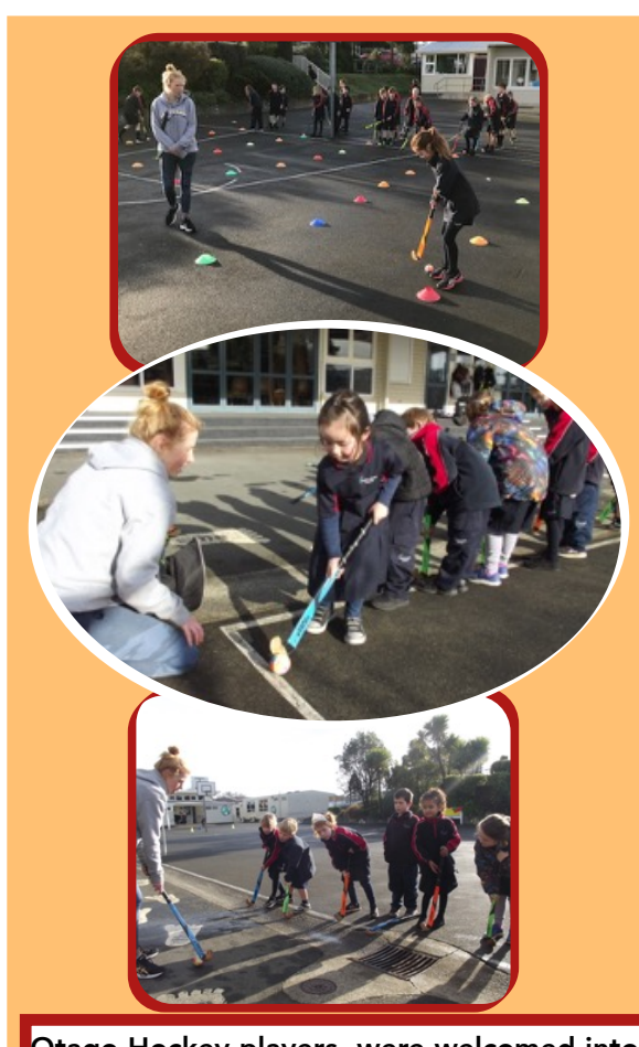
Otago Hockey players were welcomed into our school to teach hockey skills.